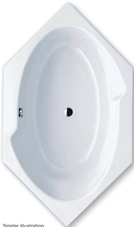
Similar illustration, Illustration shows left-hand model (standard)